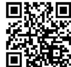
Spring Fling Online Registration

Include Spring Fling and Senate# In the Notes