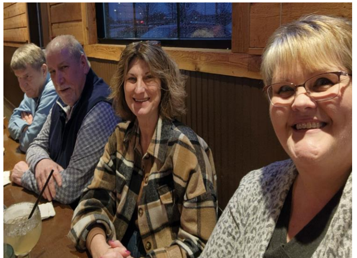
Enjoying Dinner, Drinks, and company KY/IN Joint Meeting, Louisville