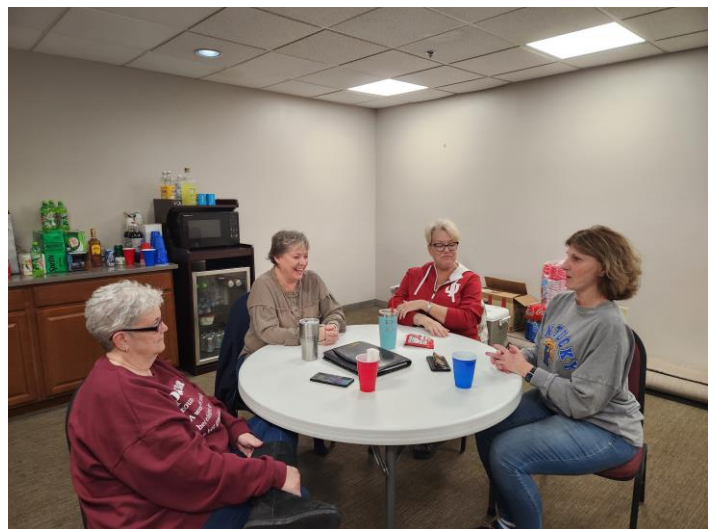
Hospitality Fun – KY/IN Joint Meeting - Louisville