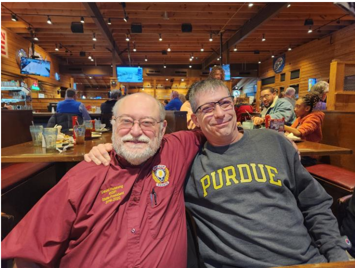
Interstate Rivalry – or Twinning for the Win KY/IN Joint Meeting, Louisville