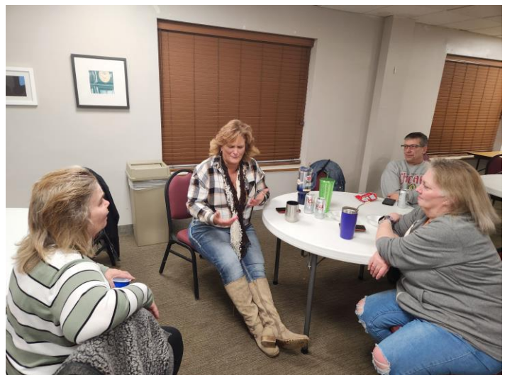
Visiting Region V JCI Senate friends KY/IN Joint Meeting, Louisville