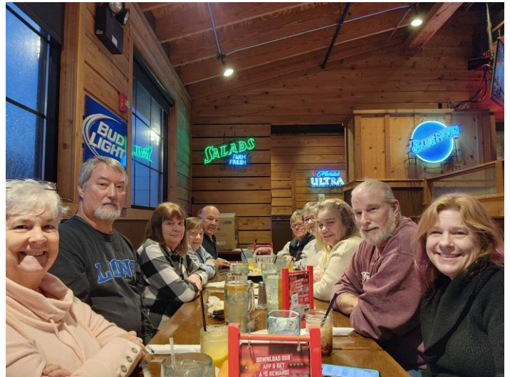
Visiting Region V NVP and Ohio friends join KY/IN Joint Meeting, Louisville