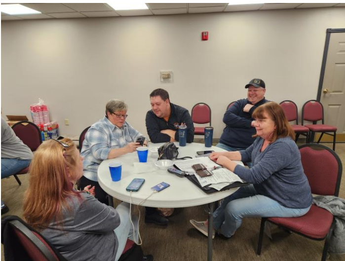
Reminiscing, Planning, and Plotting KY/IN Joint Meeting, Louisville